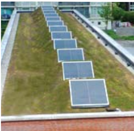
Front cover photo courtesy of Emory Knoll Farms

Vegetated roofs, or green roofs as they are frequently called, have been in existence for centuries. Sod roofs have kept many homes warm in the winter and cool in the summer with their grass or plant layer placed atop of the sod base. This natural, environmentally friendly roof provided the basis of construction for the green roof assemblies used on commercial buildings and homes throughout the world today.